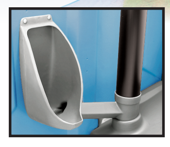
SINGLE PIECE URINAL

Tufway restrooms are very spacious and well ventilated. The seat and urinal are positioned far apart to provide a more pleasant experience for users.